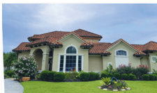
Section 1 6411 Crystal Pt The Reserve

The goal of the Yard-of-the-Month Award is to recognize the efforts of Riverstone residents who take pride in their homes and landscaping, inspiring others to do the same.