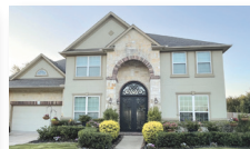
Section 4 4406 Liberty Woods Edgewood