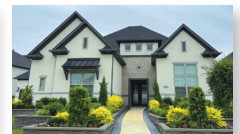
Section 6 6206 Resuriz Lane Avalon 17/19