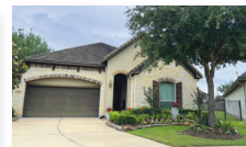
Section 5 5219 Wheaton Park Dr Providence