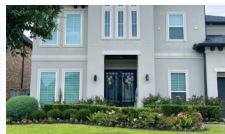
Section 2 6718 Mathews Way The Grove