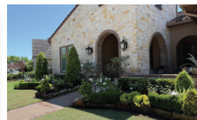
Section 3 16 Canaveral Hartford Landing