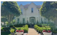
Section 1 6411 Crystal Pt The Reserve

The goal of the Yard-of-the-Month Award is to recognize the efforts of Riverstone residents who take pride in their homes and landscaping, inspiring others to do the same.