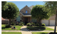
Section 2 6718 Mathews Way The Grove