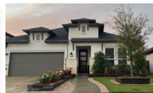
Section 4 4406 Liberty Woods Edgewood