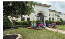
Section 5 5219 Wheaton Park Dr Providence