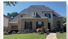
Section 6 6206 Resuriz Lane Avalon 17/19