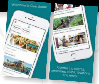
RIVERSTONE APP: From the Riverstone App (available for Android and Apple) you can view updates about events, make tennis court reservations, view public park locations, and more.

WEBSITE: Visit our website at www.rshoa.org to view the most up-to-date information about events, changes to office hours, access HOA governing documents and guidelines, and more.