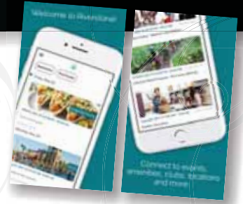
RIVERSTONE APP: From the Riverstone App (available for Android and Apple) you can view updates about events, make tennis court reservations, view public park locations, and more.

WEBSITE: Visit our website at www.rshoa.org to view the most up-to-date information about events, changes to office hours, access HOA governing documents and guidelines, and more.