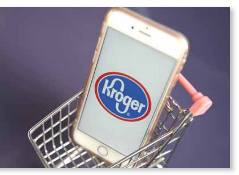
Across the street is The Village at Riverstone, which anchors our community's first on-site grocery store, Kroger. The Village houses 23 tenants offering services ranging health and beauty to banking and fitness.

Riverstone Place opened in 2019 with Starbuck's, Pacific Dental and Supercuts as the 28,000-square-foot facility's first tenants. Exercise studios F45, CycleBar and Stretch Lab quickly followed. And recently, Saladworks—a made-to-order restaurant specializing in salads, sandwiches, soups and other fare—announced plans to take up residence in Riverstone Place. More space is available to lease, so additional conveniences will be coming your way.