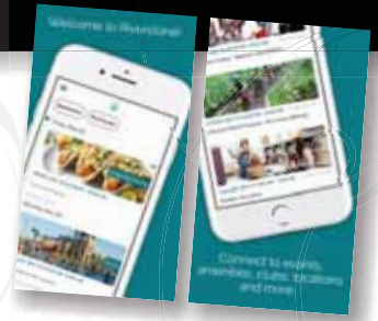
RIVERSTONE APP: From the Riverstone App (available for Android and Apple) you can view updates about events, make tennis court reservations, view public park locations, and more.

WEBSITE: Visit our website at www.rshoa.org to view the most up-to-date information about events, changes to office hours, access HOA governing documents and guidelines, and more.