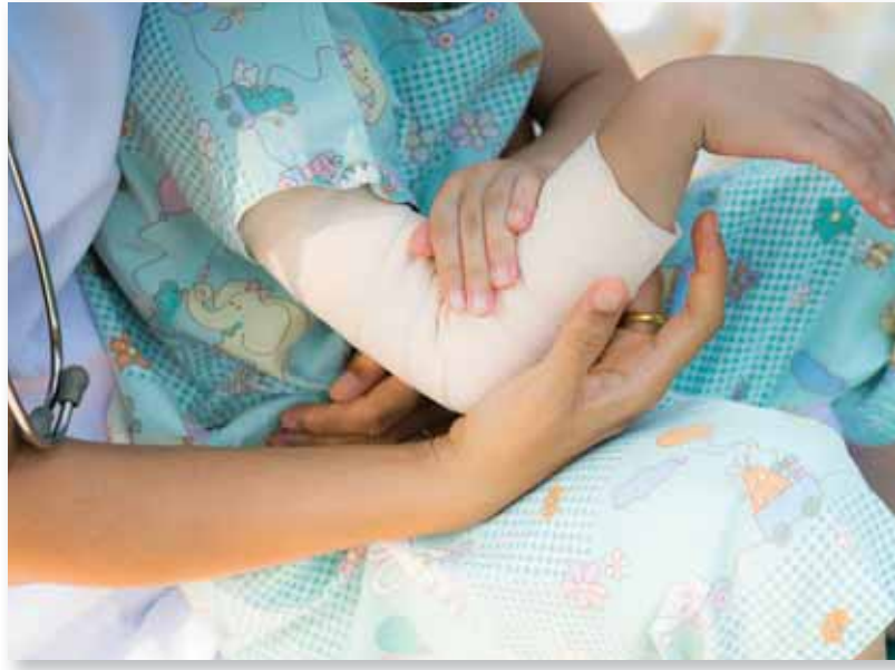
Also, available to Riverstone residents are Diesel Barbershop, Hospitality Urgent Care, Milano Nail Spa, The Joint, Angel Liquor, Chase Bank, Regions Bank, Texas State Optical, Valvoline, Umami, Upscale Cleaners, Main Squeeze Juice Company, MOD Superfast Pizza and Wendy's.

When it comes to pampering, there are plenty of options, including Aisha's Salon and Spa, Hand and Stone Massage and Nails of America. Great Clips keeps locks trimmed.