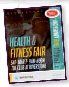
Saturday, March 7th Heath & Fitness Fair 9:00am-12:00pm