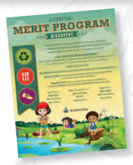
Sunday Lifestyle Merit Program (Safety)

Saturday, December 21st December 29th Winter Wonderland 5:00pm-9:00pm