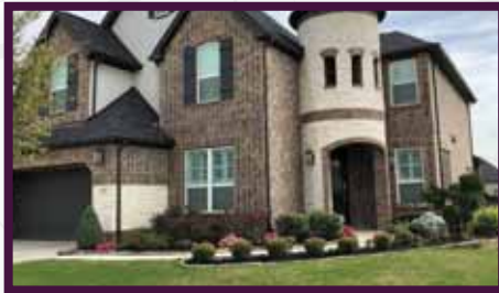
Section 2: 7011 Pebble Pass