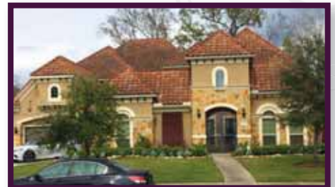
Section 6: 5702 Camden Springs Lane