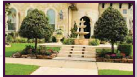
Section 4: 5078 Skipping Stone