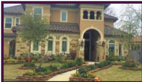
Section 5: 5810 Yarrow Creek Court