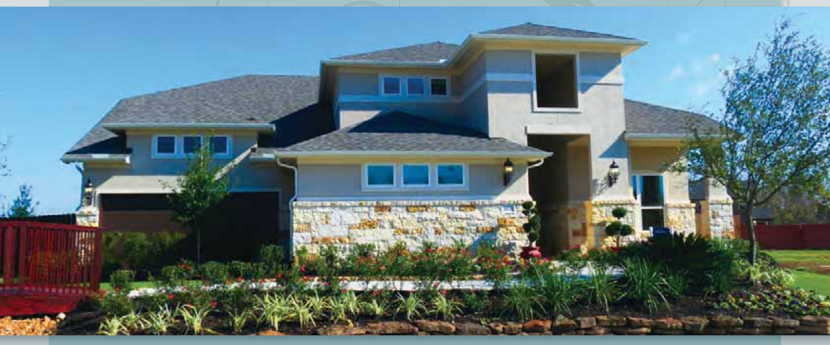
Meritage Model, 4606 Hollow Chase Lane.

Meritage is showcasing inspiring designs from the $440,000s at its new model home at 4606 Hollow Chase Lane. The builder offers 11 one- and two-story designs in Riverstone' Ivory Ridge neighborhood, ranging from 2,863 to 4,622 square feet.