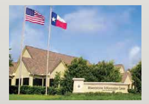
Information Center 4855 Riverstone Boulevard

Advertising Disclaimer: Riverstone Homeowners Association assumes no responsibility for the content, warranties and representations made in advertisements within this publication. All warranties and representations made are solely that of the advertiser and any such claims regarding its content should be addressed directly to the advertiser.