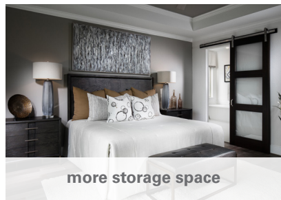
more storage space

HOMES INSPIRED BY YOU®. FIND YOUR "THAT'S ME" HOME, TODAY.