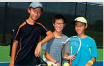
10 TENNIS COURTS