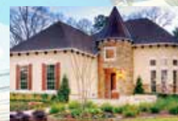
TOLL BROTHERS from the $500s