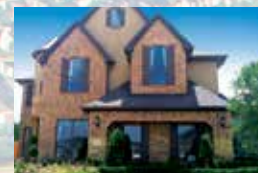
NEWMARK HOMES from the $300s

Avanti • Christopher Sims • Darling • D. R. Horton • Fairmont Fedrick, Harris • Highland • J. Patrick • Lespreance • Meritage • Newmark Partners in Building • Perry • Plantation • Peterson • Sitterle • Sterling Classic Taylor Morrison • Toll Brothers • Trendmaker • Triumph • Westin • Westport