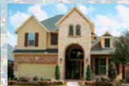
TRENDMAKER HOMES from the $300s