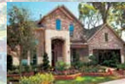
TAYLOR MORRISON from the $350s