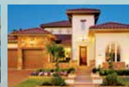
DARLING PATIO HOMES from the $340s & $450s