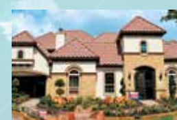
TAYLOR MORRISON from the $580s