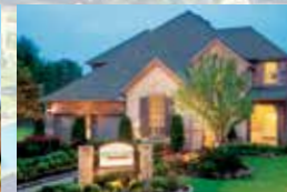
HIGHLAND HOMES from the $400s