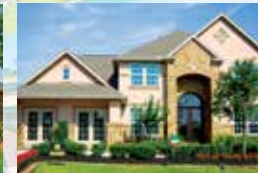
ASHTON WOODS HOMES from the $450s