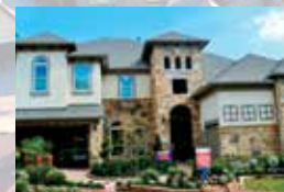
TAYLOR MORRISON from the $470s