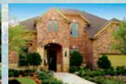
WESTIN HOMES from the $350s