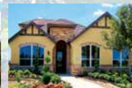
SITTERLE HOMES from the $300s