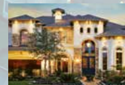
PARTNERS IN BUILDING from the $500s