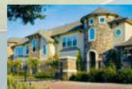
THE MANORS TOWNHOMES & PATIO HOMES from the $300s & $330s