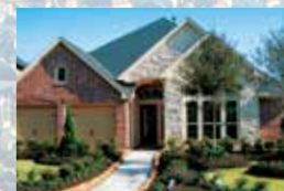
PERRY HOMES from the $300s