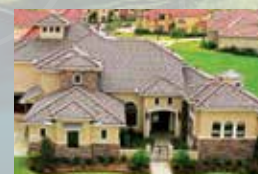
WESTPORT HOMES from the $900s