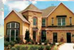
MERITAGE HOMES from the $390s