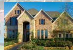
COVENTRY HOMES from the $450s