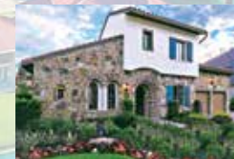
DARLING from the $470s & $600s