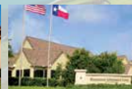
VISIT the RIVERSTONE INFO CENTER