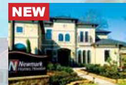
NEW NEWMARK from the $500s