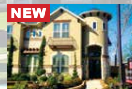
TRENDMAKER HOMES from the $500s