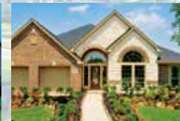
PERRY HOMES from the $400s