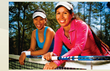
8 TENNIS COURTS