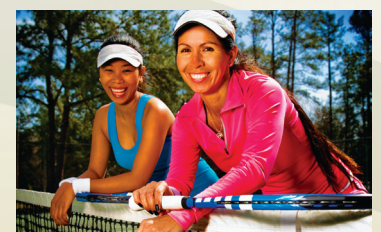
8 TENNIS COURTS