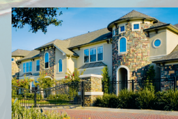
THE MANORS TOWNHOMES & PATIO HOMES from the $300s & $330s

Awesome Amenities! Waterpark Fitness Center Tennis Parks & More!