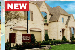
NEW HIGHLAND HOMES from the $440s