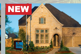
NEW DARLING PATIO HOMES from the $440s