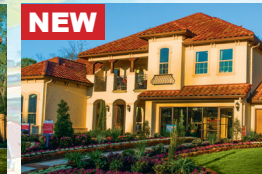
NEW TAYLOR MORRISON from the $530s