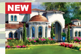
NEW PARTNERS IN BUILDING from the $1 Millions