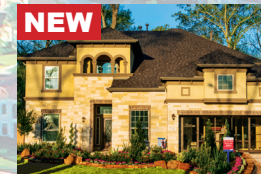
NEW TAYLOR MORRISON from the $410s