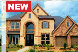
NEW PERRY HOMES from the $480s