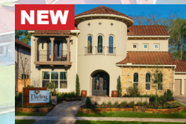
NEW DARLING HOMES from the $680s