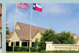
VISIT the RIVERSTONE INFORMATION CENTER