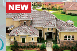
NEW WESTPORT HOMES from the $Millions

Awesome Amenities! Waterpark Fitness Center Tennis Parks & More!