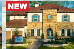
NEW DARLING HOMES from the $530s