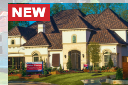
NEW TAYLOR MORRISON from the $620s