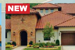
NEW DARLING PATIO HOMES from the $470s