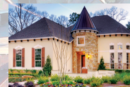
TOLL BROTHERS from the $690s