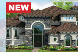
NEW FEDRICK, HARRIS from the $1 Millions