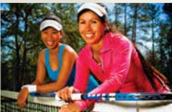
8 TENNIS COURTS