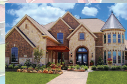
TOLL BROTHERS from the $690s