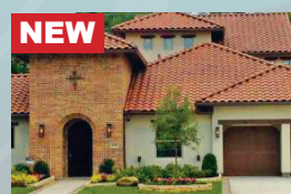
DARLING PATIO HOMES from the $470s