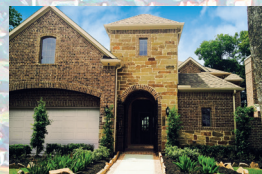
WESTIN HOMES from the $380s