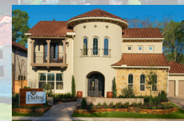
DARLING HOMES from the $720s