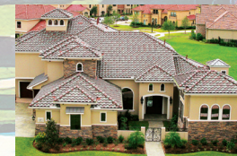
WESTPORT HOMES from the $Millions