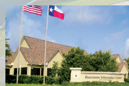
VISIT the RIVERSTONE INFORMATION CENTER