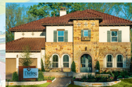
DARLING HOMES from the $670s