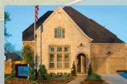
DARLING PATIO HOMES from the $440s