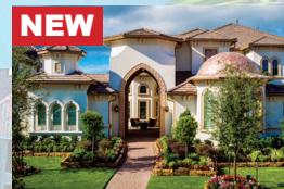
PARTNERS IN BUILDING from the $1 Millions