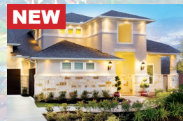
MERITAGE HOMES from the $400s