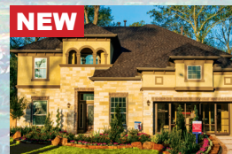
TAYLOR MORRISON from the $420s