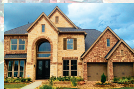
PERRY HOMES from the $480s