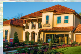
TAYLOR MORRISON from the $530s