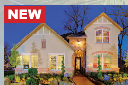
SITTERLE HOMES from the $370s