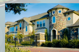
THE MANORS TOWNHOMES & PATIO HOMES from the $300s & $330s