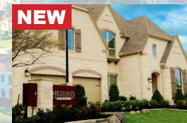
HIGHLAND HOMES from the $410s