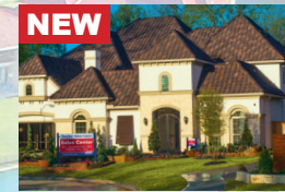
TAYLOR MORRISON from the $620s