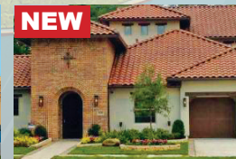
DARLING PATIO HOMES from the $470s