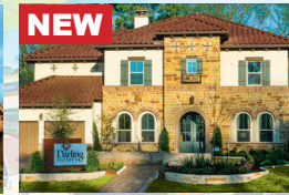
DARLING HOMES from the $530s