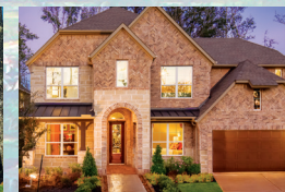
MERITAGE HOMES from the $400s