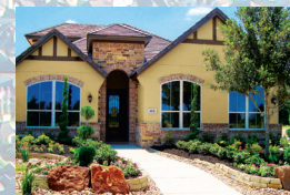
SITTERLE HOMES from the $370s