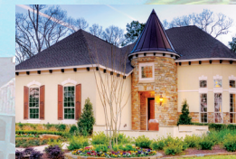
TOLL BROTHERS from the $690s