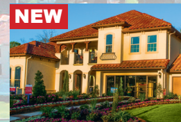
TAYLOR MORRISON from the $530s