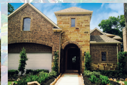
WESTIN HOMES from the $380s