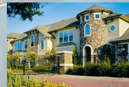
THE MANORS TOWNHOMES & PATIO HOMES from the $300s & $330s