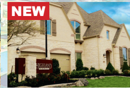
HIGHLAND HOMES from the $440s