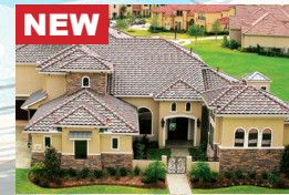
WESTPORT HOMES from the $Millions