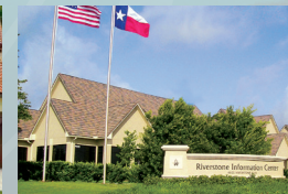
VISIT the RIVERSTONE INFORMATION CENTER