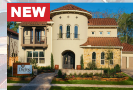
DARLING HOMES from the $680s