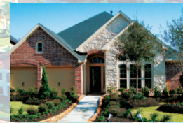
PERRY HOMES from the $410s