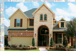
TRENDMAKER HOMES from the $380s