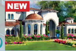
PARTNERS IN BUILDING from the $1 Millions

Awesome Amenities! Waterpark Fitness Center Tennis Parks & More!