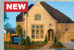
DARLING PATIO HOMES from the $440s