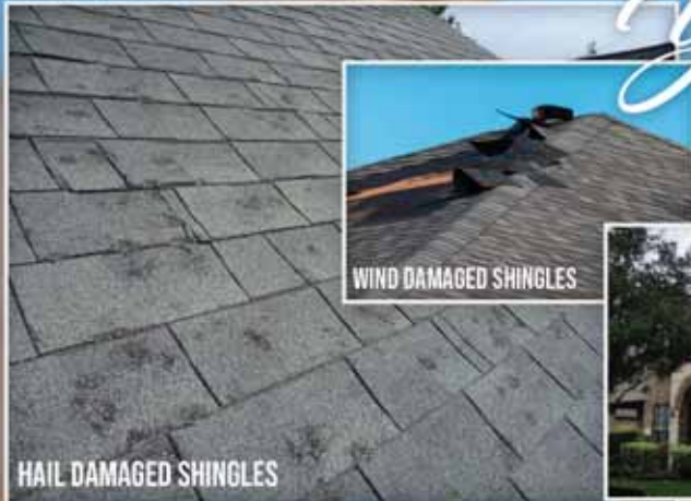
WIND DAMAGED SHINGLES