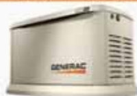
GENERAC AUTOMATIC STANDBY GENERATOR