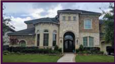
Section 4: 5012 Bellevue Falls