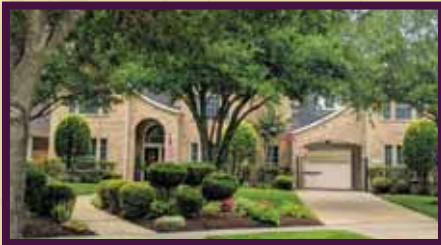
Section 1: 6626 Sutters Creek