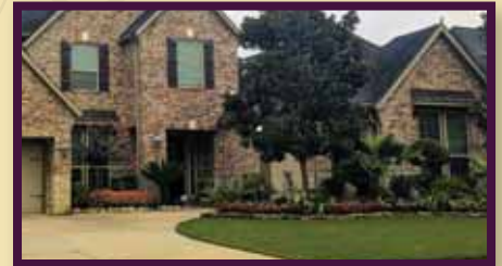
Section 3: 6219 Duke Trail Lane