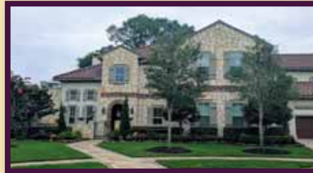
Section 5: 5026 Tillbuster Ponds Ct.