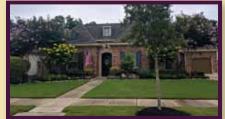
Section 6: 6215 Logan Creek