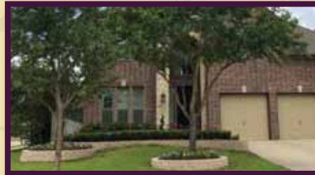
Section 2: 3430 Canton Hills