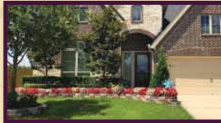
Section 2: 3947 May Ridge Ln