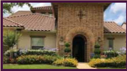
Section 4: 4826 Summer Manor