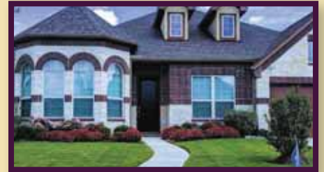
Section 6: 4514 Highland Field