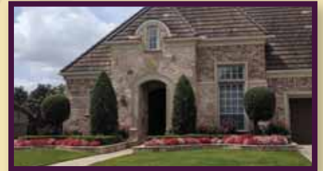
Section 3: 4430 Horizon View