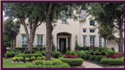
Section 1: 5103 Briarcross Court