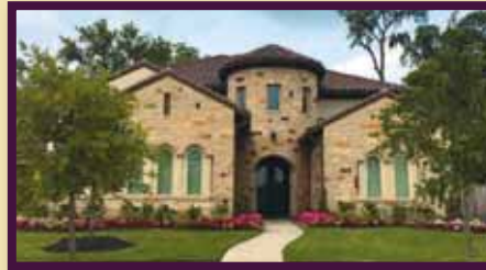
Section 5: 5431 Flyers Cove