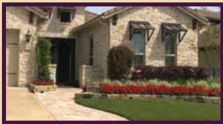
Section 4: 4726 Bellwood Springs