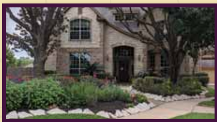
Section 1: 6406 Harbor Mist