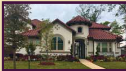
Section 5: 5406 Rouchel Brook