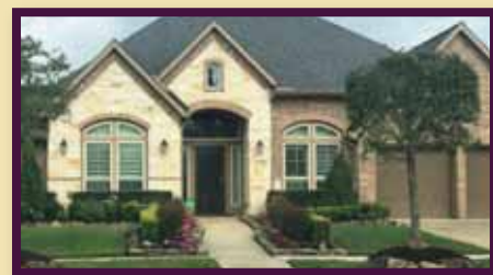
Section 3: 4203 Pebble Heights