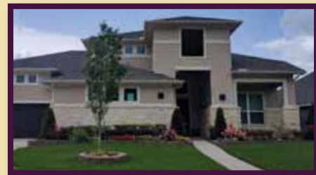
Section 6: 5322 Sterling Manor