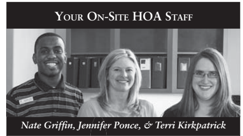
YOUR ON-SITE HOA STAFF